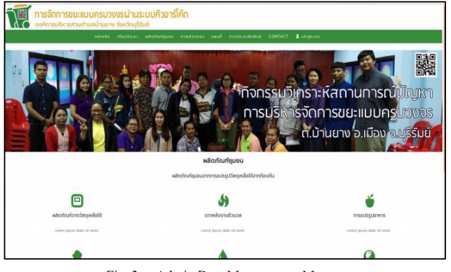
Fig. 3. Admin Data Management Menu.

From Table II, the results of the study on the quality of the application for a waste management via QR Code system by three experts revealed that the overall quality of the application was at a high level. The application design aspect was at the highest level. In terms of application usage and information security aspects were at a high level.