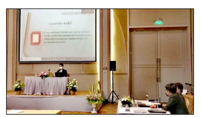
Fig. 2. Presentation for Application Technology Dissemination.