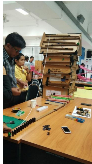
Figure 2. Utilizing the engineering design process to design, build, and test their creations of the prototype