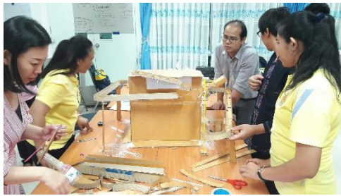
Figure 1. Simple machines, as incorporated into the “Chain Reaction in Marble Run Activity

The STEM workshop consisted of four activities lasting about two hours and 30 minutes each. Three areas were identified for the development of workshops. The areas were: (1) exploring STEM concepts, which was principally concepts, methodologies, tools, and applications; (2) engineering design process, which was a mindset that emphasizes open-ended problem solving and encourages learners to learn from failure; (3) good design, materials, and construction, which was principally preparation and testing of structures; (4) simple machines, as incorporated into the “Chain Reaction in Marble Run Activity (Figure 1).”