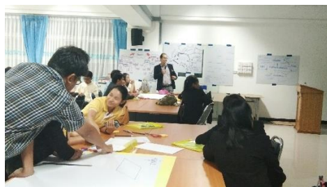
Figure 3. Facilitator asking the higher-order thinking questions during STEM workshop

The integrated STEM workshop lasting for 2 days (organized during 17-18 February 2018) was designed with a focus on encouraging rural in-service science teachers to solve an ill-defined problem utilizing the engineering design process to design, build, and test their creations of a chain reaction in marble run (see Figure 2). In the challenge situation, teachers would be asked to consider the constraints of the materials and time, identify the problem, think about what they already know, design, plan, construct, test and evaluate a physical prototype of their track design. Teachers were encouraged to construct a convincing argument for a particular solution as opposed to all other possible solutions and start out by drawing plan of their prototype with dimensions and details on a